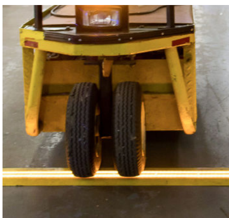
Cargo friendly safe

Speed bump gives a sensory notice to drivers that they are entering a dangerous blind intersection.