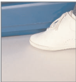
Full Perimeter Electric Toeguard