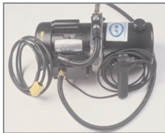
Remote Power Unit