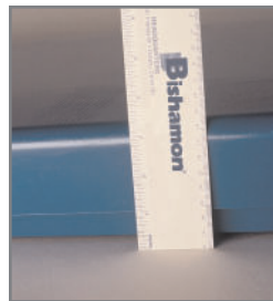
2.9" Lowered Height On Models Up To 1,100lbs